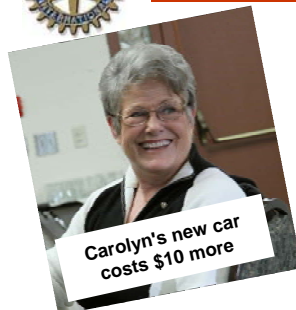
Carolyn's new car costs $10 more