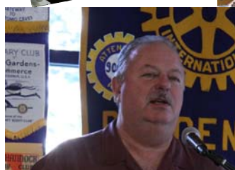
Pres Bruce runs unannounced drill on local paramedic team