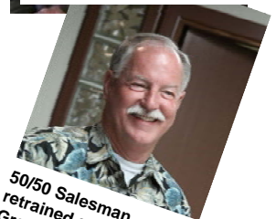
50/50 Salesman retained as Secret Greeter